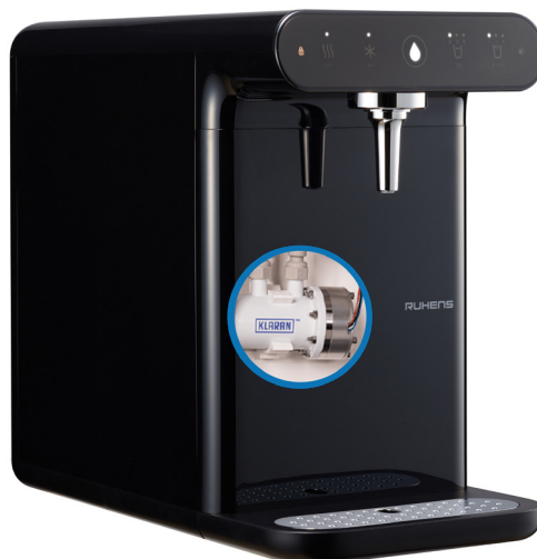
ArcticRevolution 70B KLARAN