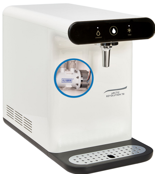
ArcticRevolution 70 KLARAN

The KLARAN UVC LED shield is situated between the direct chill tank and the dispensing tap to provide point of dispense protection from bacteria and viruses